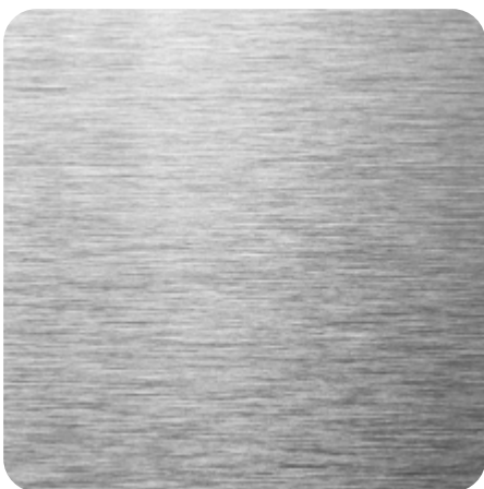
Stainless Steel WF30 Brushed