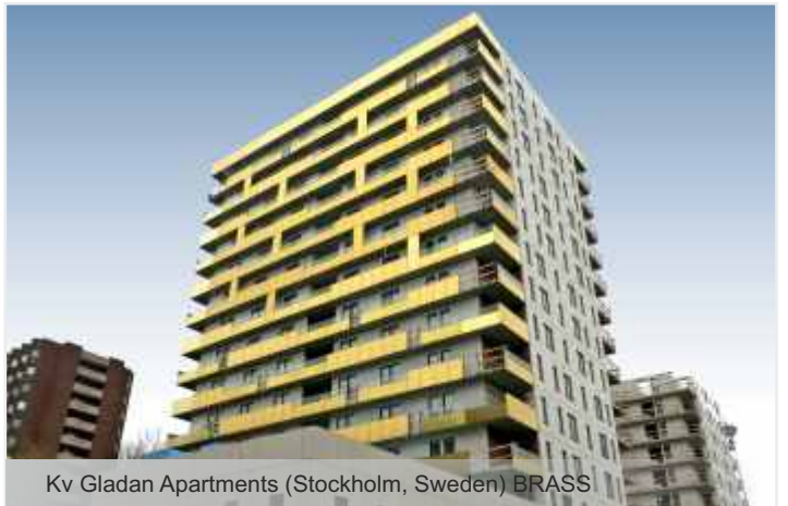
Kv Gladan Apartments (Stockholm, Sweden) BRASS