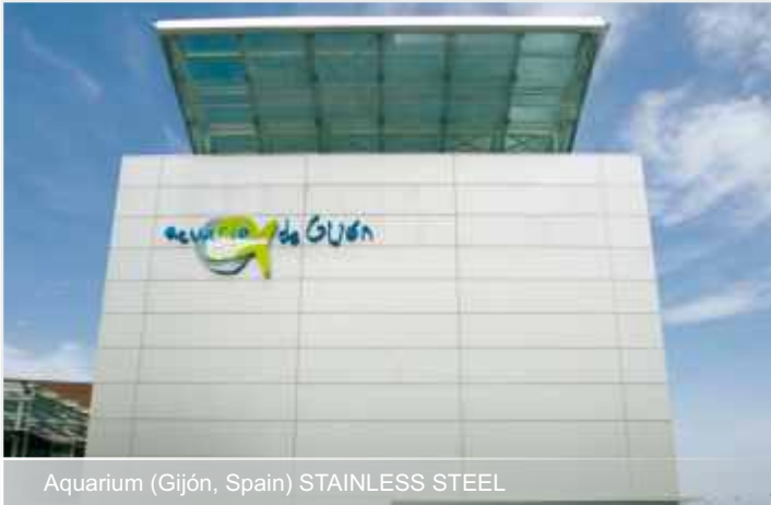
Aquarium (Gijón, Spain) STAINLESS STEEL