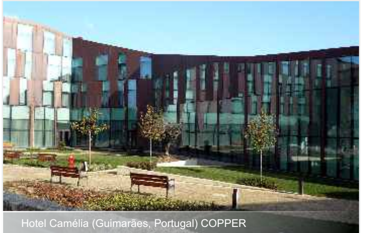
Hotel Camélia (Guimarães, Portugal) COPPER