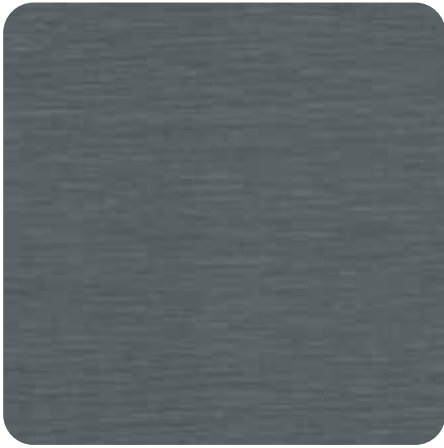
Zinc Blue (only larcore* )

Noble metals such as Stainless Steel, Copper, Brass and Zinc are shown in their natural appearance. The lack of treatment makes these composites the ideal ecological solution and provides the sensation of liveliness from the distinctive nature's finest elements. Lightness and flatness Alucoil's panels.