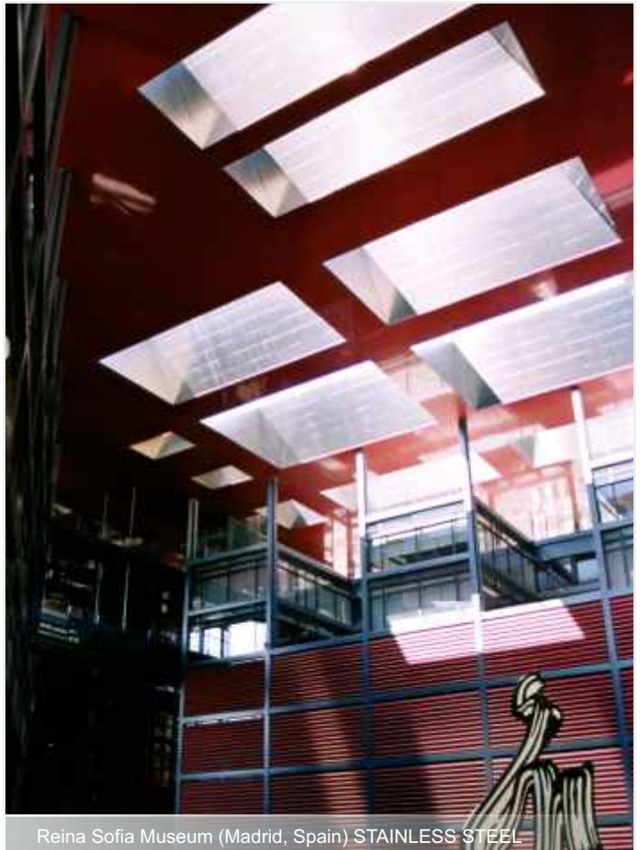
Reina Sofia Museum (Madrid, Spain) STAINLESS STEEL