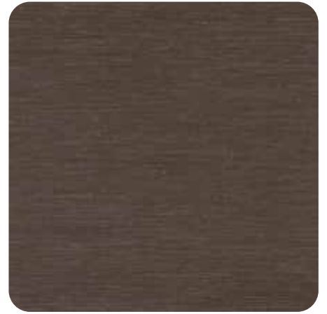
Zinc Brown (only larcore* )