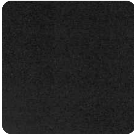
Zinc Ebano (only larcore* )