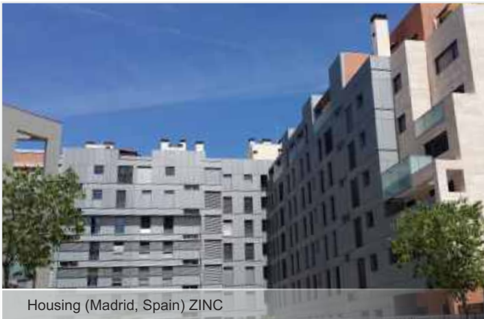
Housing (Madrid, Spain) ZINC