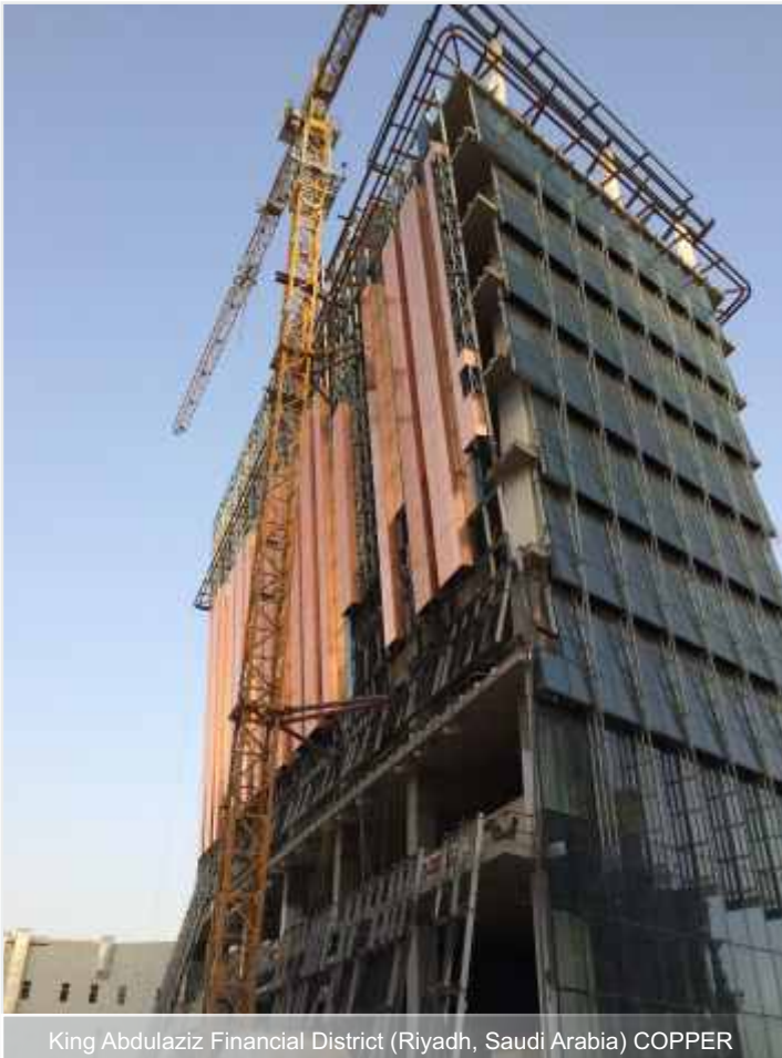
King Abdulaziz Financial District (Riyadh, Saudi Arabia) COPPER