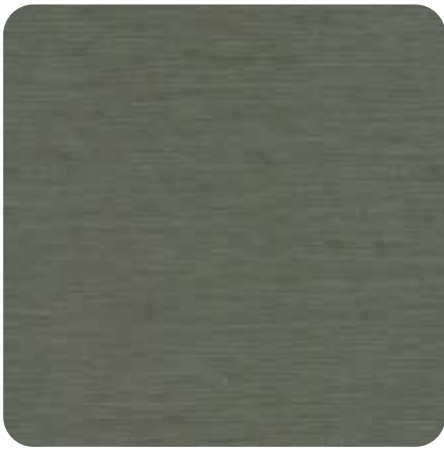
Zinc Green (only larcore* )