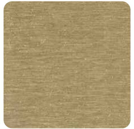
Zinc Gold (only larcore* )