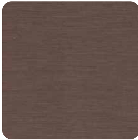
Zinc Red (only larcore* )